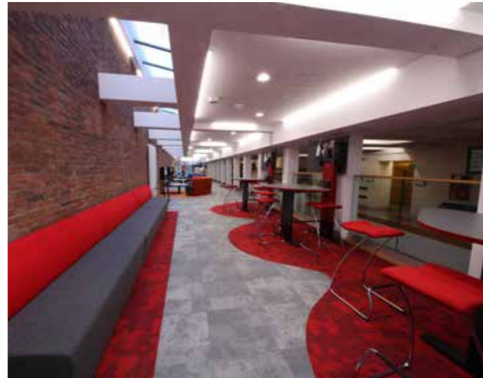
Hull University Middleton Hall.