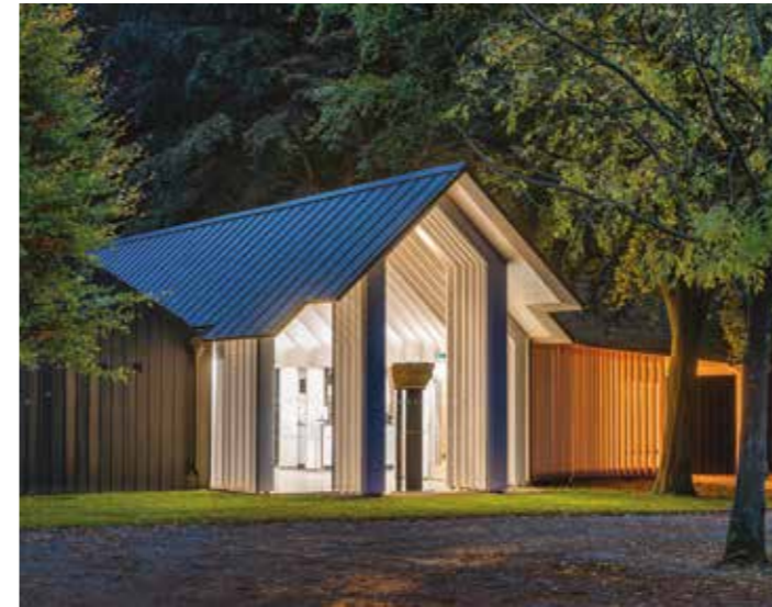
New visitor centre for English Heritage at Rievaulx Abbey.