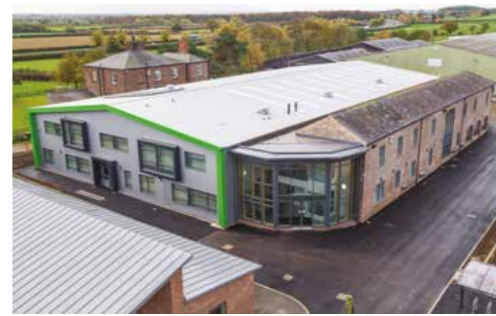
Askham Bryan College Agritech building.