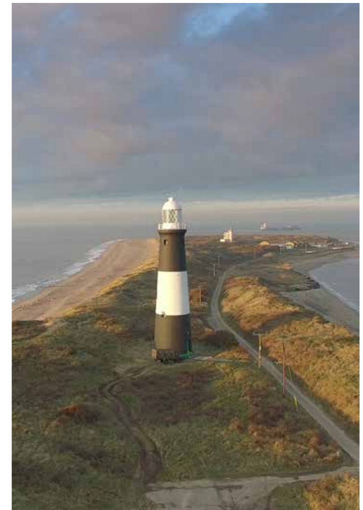
Refurbishment at Spurn Point Lighthouse for Yorkshire Wildlife Trust.