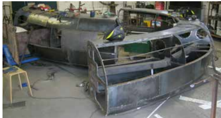
Erith Ring, sculpture and design of support armature.