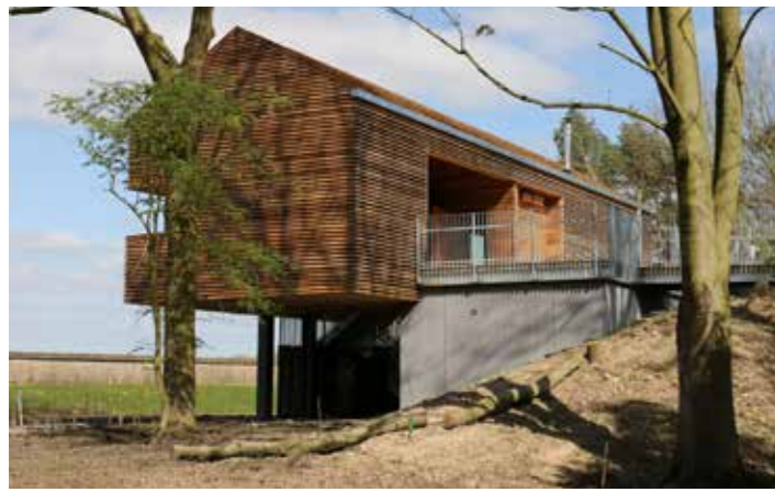
Tophill Low, birdwatching hide and education facility.