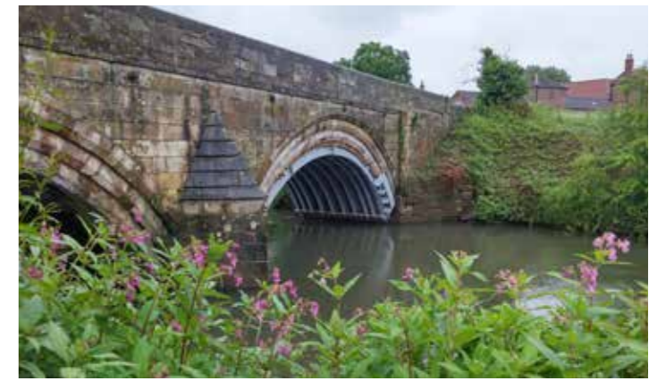
Kexby Old Bridge, bridge repairs.