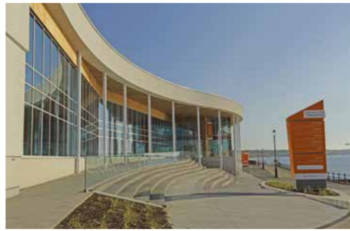
Promenade at East Riding Leisure, Bridlington.