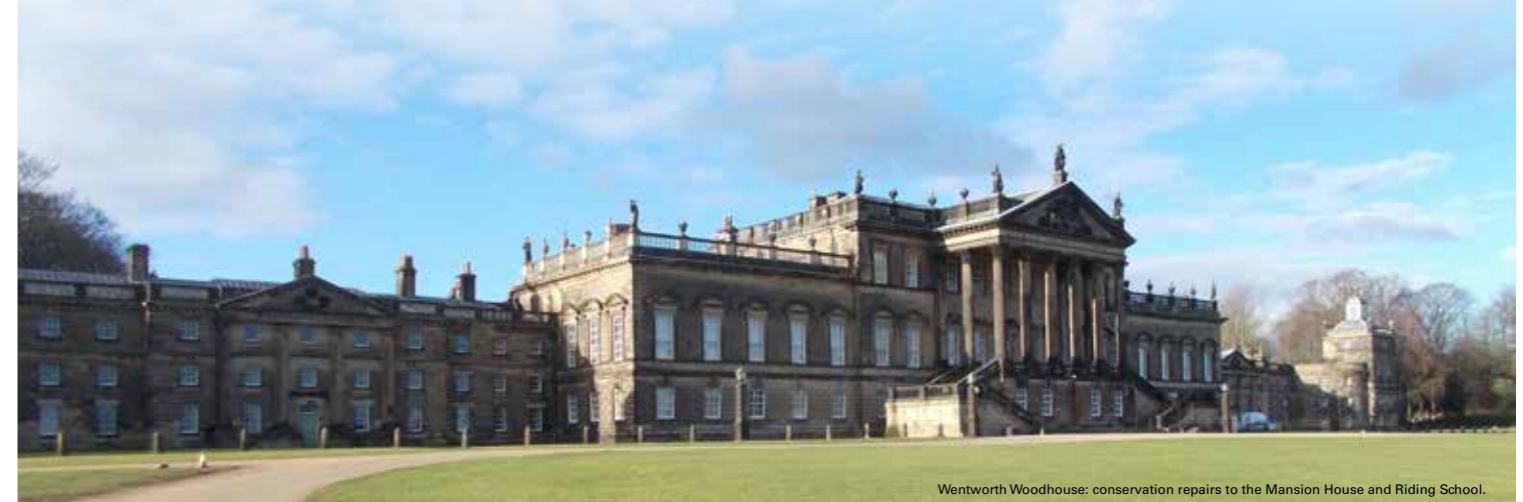
Wentworth Woodhouse: conservation repairs to the Mansion House and Riding School.

We provide our clients with the best value service and will continue to develop and grow our business. We build on what we do well and encourage innovation to meet our clients' needs. We value the skills and experience of our staff and the contribution everyone makes to our business.