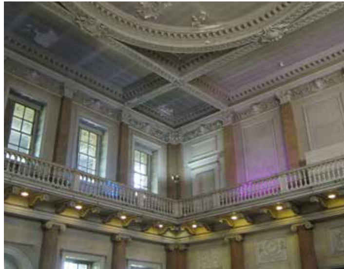
The Marble Saloon, Wentworth Woodhouse, strengthening and repairs to roof structures.