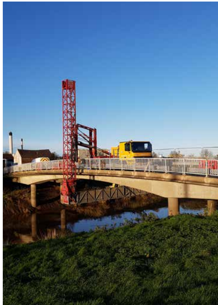
Rawcliffe Bridge – Principal inspection of underside.